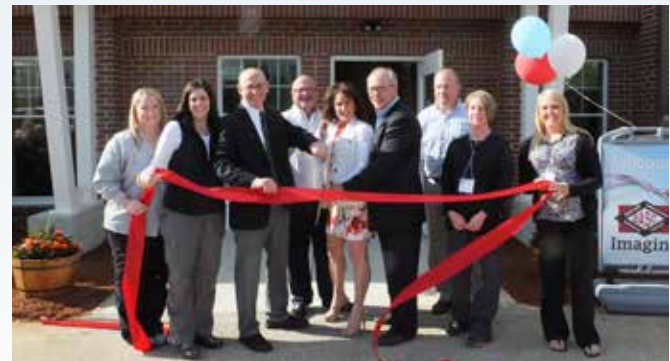
Grand opening of BASC Imaging Center .

Quinnipiac University Regis College River Valley Community College River College Sacred Heart University Saint Anselm College Saint Joseph's College Saint Joseph's School of Nursing Salter School Seacoast Career Schools Simmons College Southern NH University (SNHU) Southern University of NY (SUNY) The Catholic University U Mass Boston U Mass Lowell U Mass Worcester UNH UNH - Manchester University of Hartford University of New England University of Phoenix University of South Alabama University of Southern ME University of VT Walden University Wentworth Institute of Technology Worcester State College