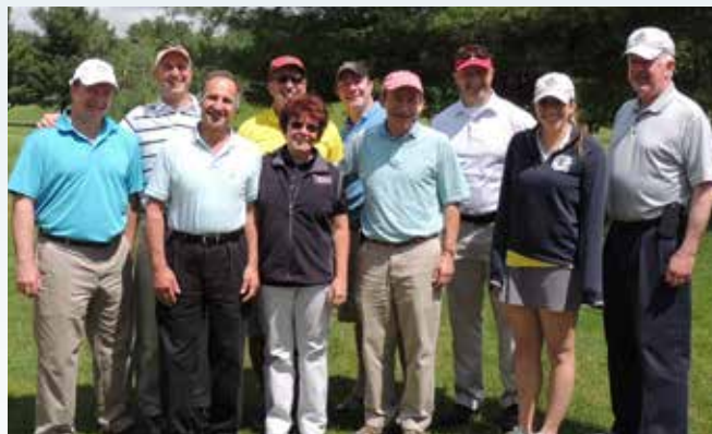
CMC physicians, staff and friends enjoy a day of golf in support of The New England Heart & Vascular Institute.

Billy's Sports Bar & Grill Candia Woods Golf Links Canobie Lake Park CMC - Community Outreach and Wellness CMC - Outpatient Rehabilitation Svcs. at Dartmouth Commons Edible Arrangements