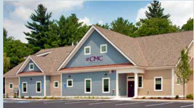
New Hooksett Medical Park: primary care, physical therapy and lab facilities.